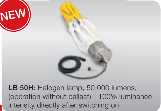
LB 50H: Halogen lamp, 50,000 lumens, (operation without ballast) - 100% luminance intensity directly after switching on