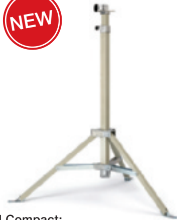
Tripod Compact: Light source height of 3.4 meters