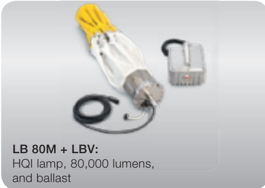
LB 80M + LBV: HQI lamp, 80,000 lumens, and ballast