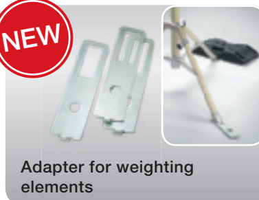
Adapter for weighting elements