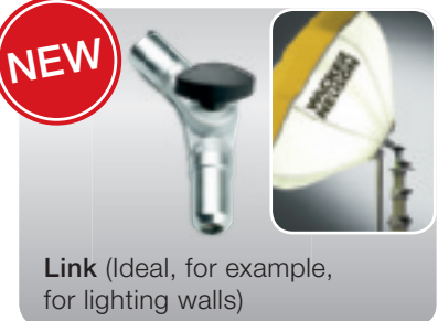
Link (Ideal, for example, for lighting walls)