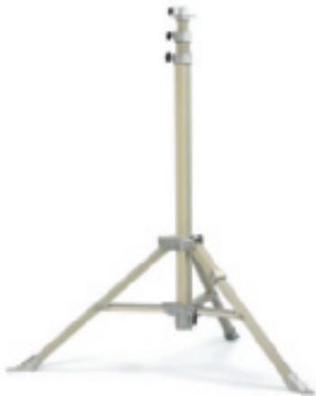
Tripod Pro: Light source height of 5 meters