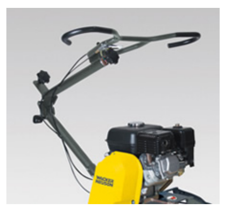
Standard guide handle with adjustable handle and foldable center pole for easy transport