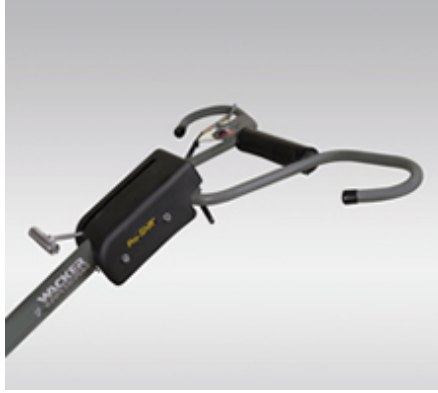
Height adjustable handle with Pro-Shift® System enables continuous adjustment of the floating blade pitch as well as individual height adjustment.